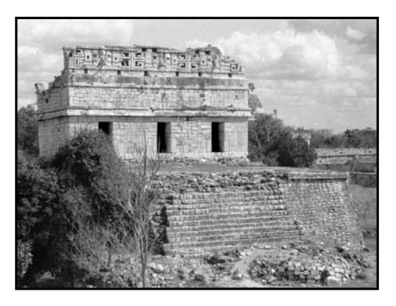
Photo: The Casa Colorada (Structure 3C9) at Chichén Itzá Photo of Markus Eberl

Terminal Classic inscriptions at Chichén Itzá are among the few that mention fire rituals outside of the 819-day cycle and that provide more information about the actors, the deities, and the kind of fire ritual. Of particular importance are the fire rituals in the text from the Casa Colorada.