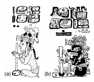
Fig. 2: Fire drilling rituals in Maya Codices. (a) Codex Dresden page 6 Drawing by Markus Eberl after Lee 1985

Lintel 4 of Chichén Itzá's Temple of the Four Lintels begins for example with the Short Count 9 Lamat k'in tu 13 Yax til 13 Tun 1 Ahaw or "day 9 Lamat 13 Yax in the 13th Tun of Katun 1 Ahaw". Three Katuns ended with 1 Ahaw during the Classic period (8.17.0.0.0, 9.10.0.0.0, and 10.3.0.0.0). The combination of the Calendar Round date 9 Lamat 13 Yax in a 13th Tun of a Katun 1 Ahaw repeats itself only every 18,720 years. F within the historical framework of Maya culture, the Short Count corresponds to the Long Count 10.2.12.1.8 9 Lamat 13 Yax or July 9, A.D. 881 in the Julian Calendar (GMT-L correlation with the numerical constant 584285; Lounsbury 1992).